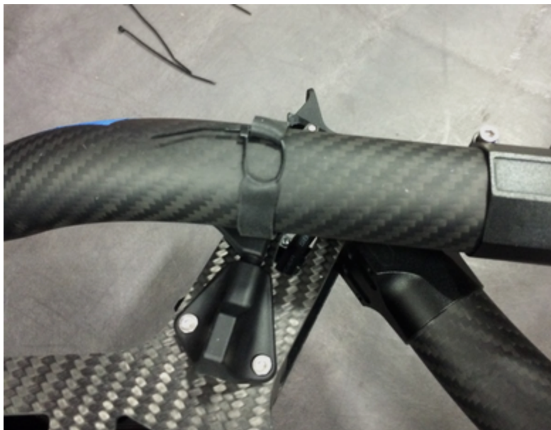
Figure 2.1: Zip tie through both ends of band

Step 2: Loop a zip tie through both ends of the band. Tighten the zip tie to pull the band taught around the boom. The band should wrap completely around the boom.