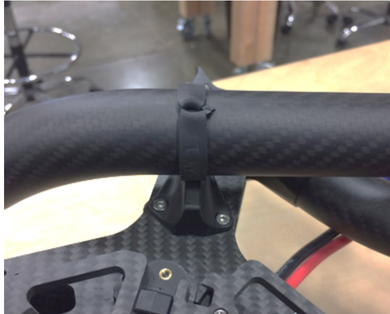
Figure 3.1: Correct placement of band

Step 3: Ensure the protective band prevents the boom retention clip from contacting the inboard side of the boom.