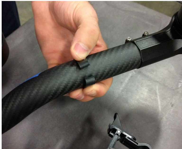
Figure 1.2: Wrapping band around the boom