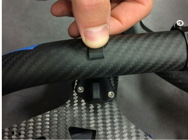
Figure 1.1: Band placement

Step 1: Take one band and position it near the boom retention clip. Wrap it around the boom.